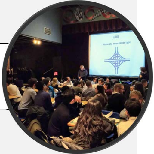
Annual Transportation Trivia Night