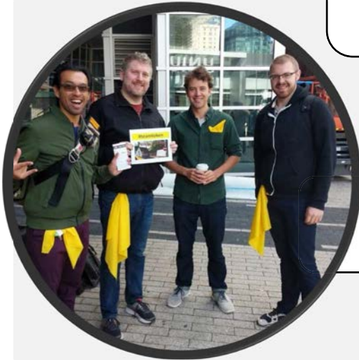
Ticket to Ride Scavenger Hunt