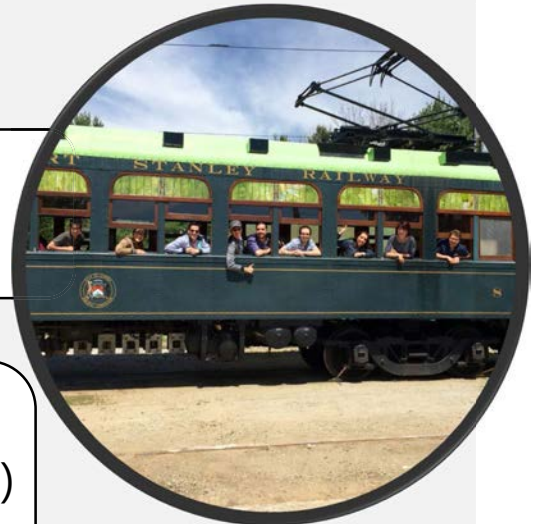
Halton Radial Railway Museum Visit